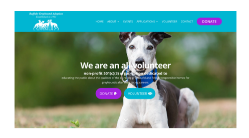
WELCOME TO BUFFALO GREYHOUND ADOPTION Since 1991, we have been equilibrium and training the Western New Task community to enrich the less of humans and carriers, with have wonded with professional and sight dround expensions on therefore the trained doors are force and we are commend to

Be sure to visit today and check back often for all our event info!