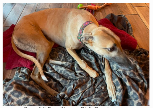
Pam (VJ Smalltown Girl) Graziano