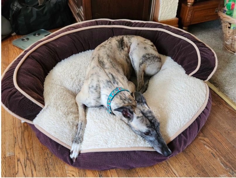
Molly (VS Dognamedblue) Fraas