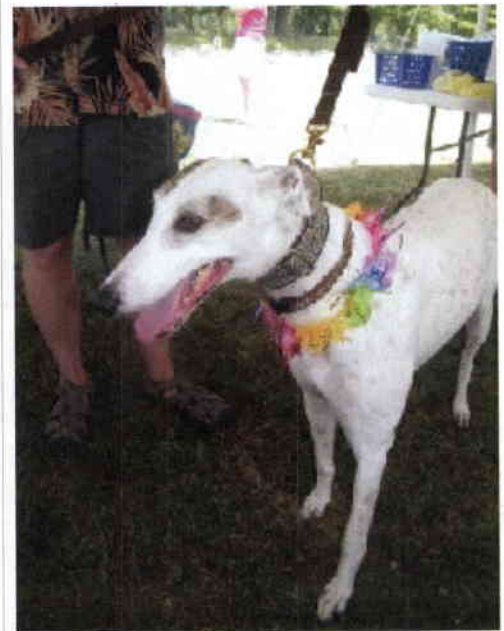
It was a BGA luau on Sunday, July 17 at the Lily of the Valley Banquets, Cheektowaga, as BGA held a Hawaiian Summer Chicken Barbecue. Pets and their families enjoyed great food, games and time spent with BGA friends!