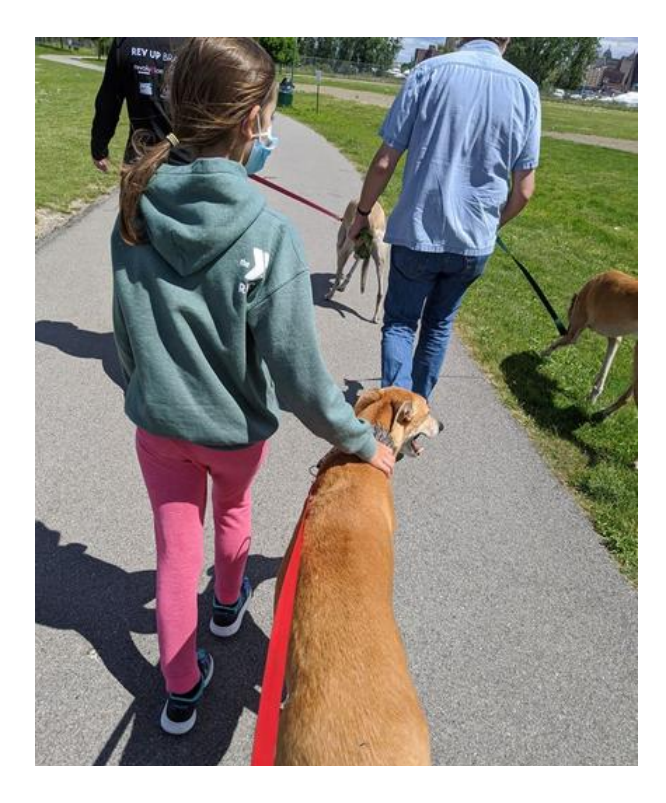
Buffalo Greyhound Adoption Established in 1991

Greyhounds and children do go together- it just takes common sense, boundaries and careful introductions.